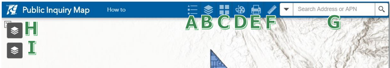
Window Header Top Row Navigation

Explore the different possibilities by learning how to navigate the updated interface!