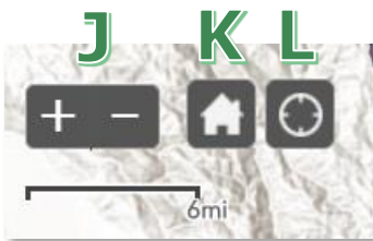
Bottom Left Side of Window Navigation